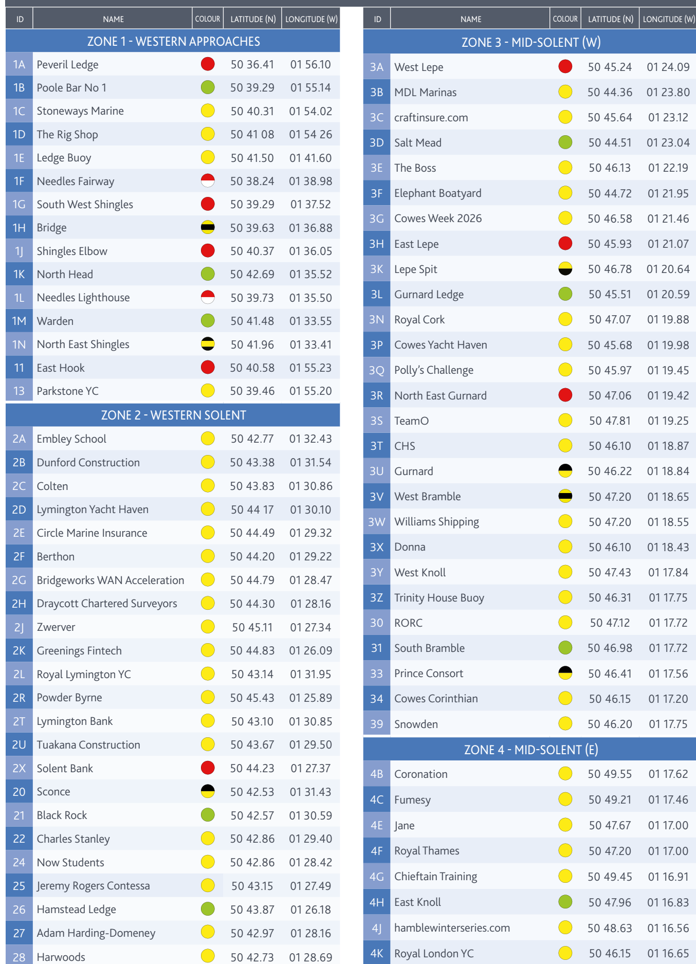
TABLE 4 : RACING MARKS